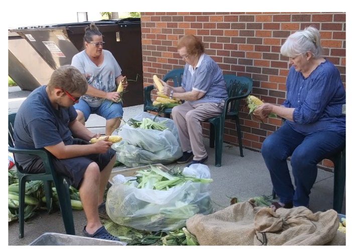
Previous Immanuel Corn Feed Corn Huskers